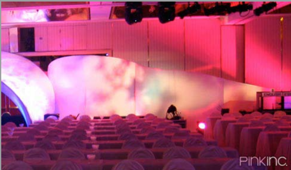
Part of Pink Inc.'s Wave Wall series, the Continental Divide and its varied heights make for clever entryways and exits, as well great projection and lighting surfaces.