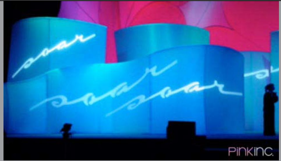
A Continental Divide, when used in conjunction with other items from the Wave Wall series, created a stunning stage set that wowed the crowd! Lighting and projection adds to the overall effect, making your event one to remember.