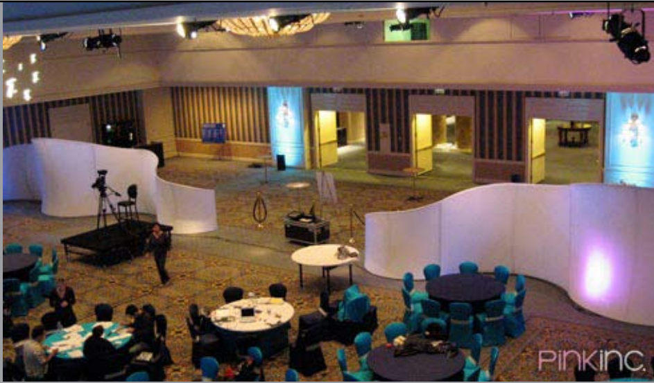
Pink Inc.'s Continental Divide is a 27'-long curved wall whose height fluctuates from 4' to 9'. Seen here as a room divider, the Continental Divide structures are creative and versatile design choices for events.