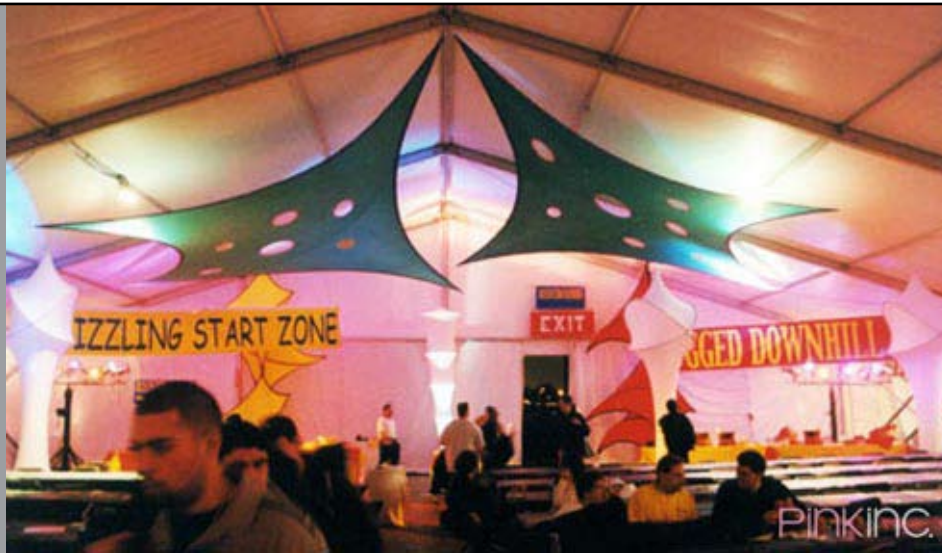
Soaring high above the crowd, the Gruyeres give a run-of-the-mill event space a fun, out of the ordinary look. Simple eye-catching shapes draw the eye upwards and add a sense of wonder to the occasion.