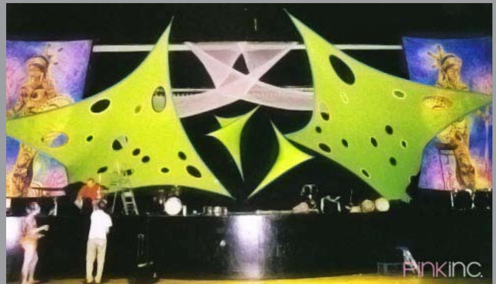
The Gruyere is a large structure with holes cut into the fabric (think cheese!). Primarily created in bright colors with complementary colorful edging, these majestic shapes can be rigged flat for a stage set or more sculpturally. Take a look at the smaller structures in the center of the stage and imagine the possibilities!

Any and all rights (including, without limitation, copyright, design patent, use patent and trademark) in and to all designs, concepts, renderings, or graphics (collectively, "Design") represented in this document were created by Pink Inc. and remain the sole and exclusive property of Pink Inc. Use of any such Design by the recipient without required purchase is strictly prohibited. ©2009