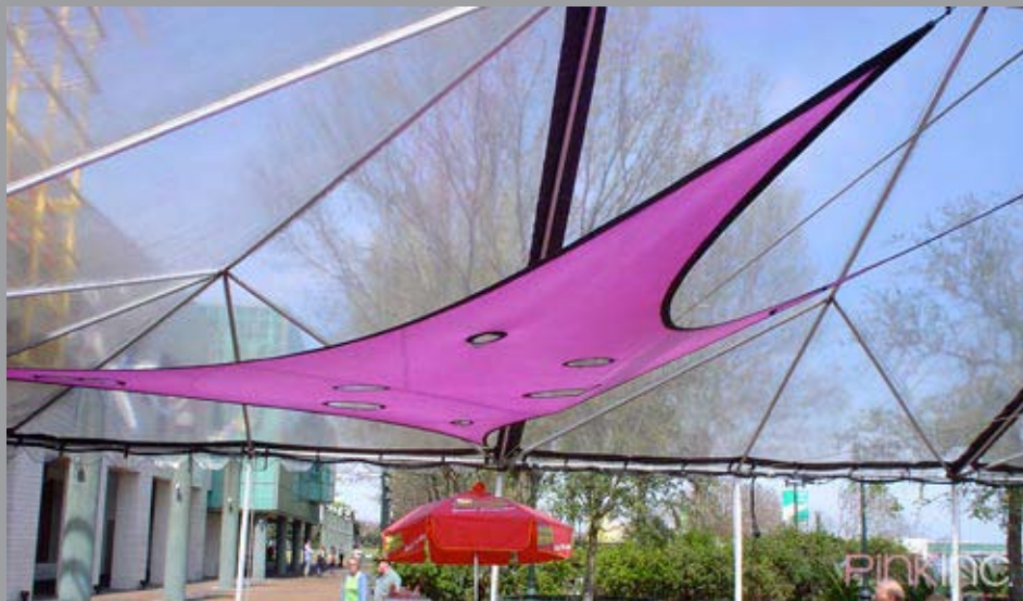
Suspended tension fabric structures transform your tent interior from ordinary to extraordinary! Combine various stretched shapes to make a bold statement—and give event attendees a truly memorable experience.